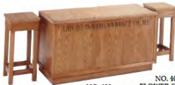
NO. 400 FLOWER STAND 14" x 14" x 32" H