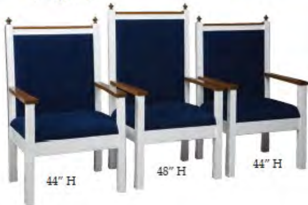
NO. 800 PULPIT CHAIR 27" W, 21" D