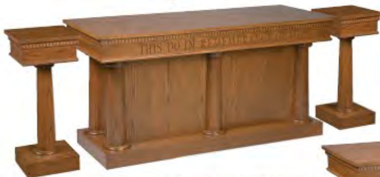
NO. 8300 FLOWER STAND 14" W, 14" D, 32" H