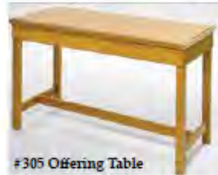
#305 Offering Table 36" Long x 22" Deep x 32" High

Offering Tables and Offering Desks are finely hand-crafted and are available with optional locking drawer, or inscriptions "TITHE" or "OFFERING".