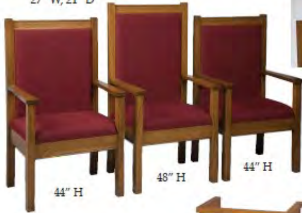
NO. 400 PULPIT CHAIR 27" W, 21" D