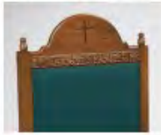
OPTIONAL CROWN BACK