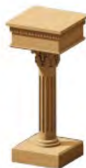
NO. 8500 FLOWER STAND 14" W, 14" D, 32" H