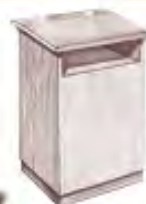
NO. 33 REGISTRY DESK 24" wide, 18" deep, 43" high