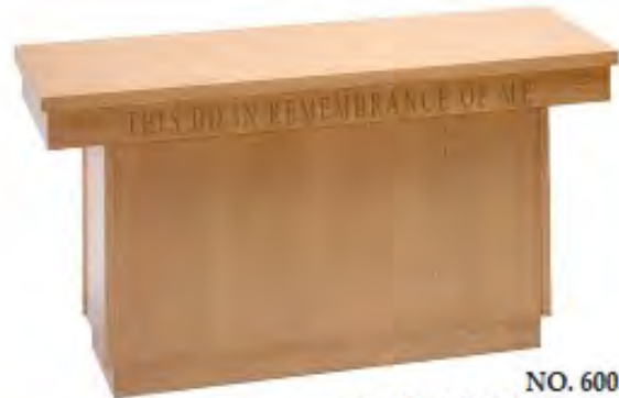
NO. 600 COMMUNION TABLE 60" W, 24" D, 32" H