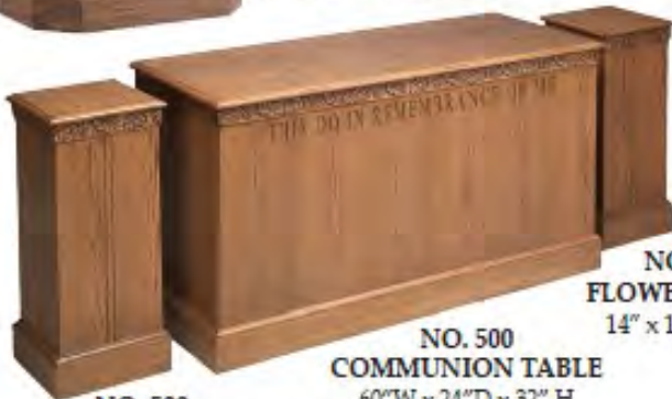
NO. 500 COMMUNION TABLE 60" W x 24" D x 32" H