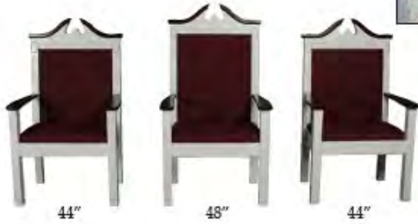
NO. 8200 PULPIT CHAIRS, TWO-TONE 27" W, 21" D