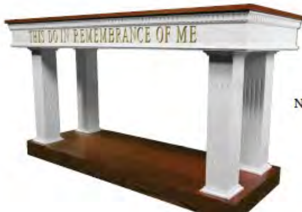
NO. 8405 COMMUNION TABLE 60" W, 24" D, 32" H (also available in all-stained)