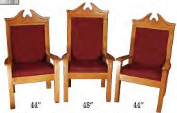
NO. 8200 PULPIT CHAIRS, ALL-STAINED 27" W, 21" D