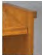
Adjustable Bible Rest