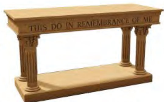
NO. 8505 COMMUNION TABLE 60" W, 24" D, 32" H