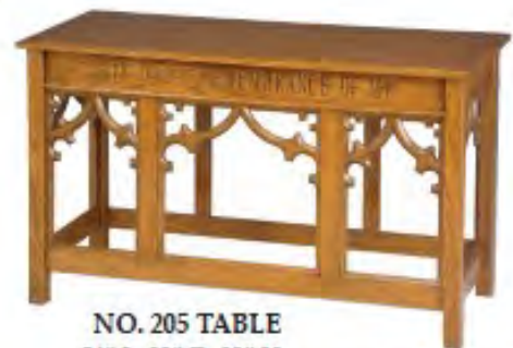
NO. 205 TABLE 54" L, 22" D, 32" H