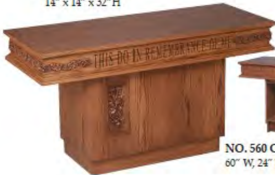
NO. 560 COMMUNION TABLE 60" W, 24" D, 32" H