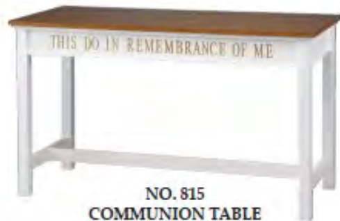
NO. 815 COMMUNION TABLE 54" L, 22" D, 32" H