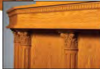
NO. 8500W WING PULPIT 76" W, 27" D, 48" H