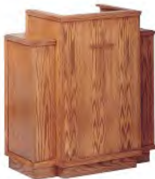
NO. 400W WING PULPIT with cross 45" W, 18" D, 48" H