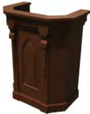
NO. 900 LECTERN 39 1/2" W, 24" D, 48" H