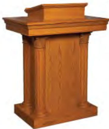
NO. 8500 PULPIT 36" W, 24" D, 46" H