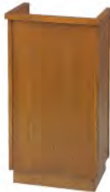
NO. 301 PULPIT 24" W, 16" D, 48" H