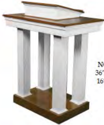
NO. 8401 PULPIT 36" W, 24" D, 46" H 16" x 20" Bible rest