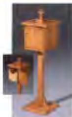
#18 Tithe Box 12" x 12" x 32"

Tithe Boxes are available in a variety of finish colors and come standard with lock.