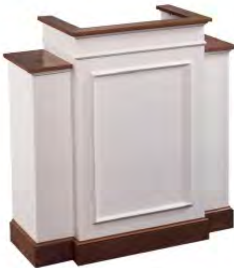
NO. 810W WING PULPIT 45" W, 18" D, 48" H