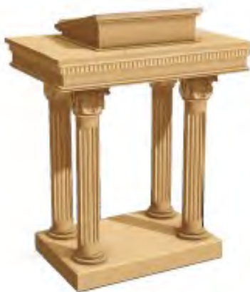
NO. 8501 PULPIT 36" W, 24" D, 46" H