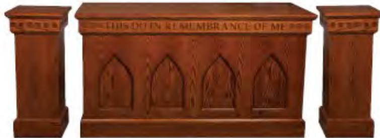
NO. 900 FLOWER STAND 14" W, 14" D, 32" H