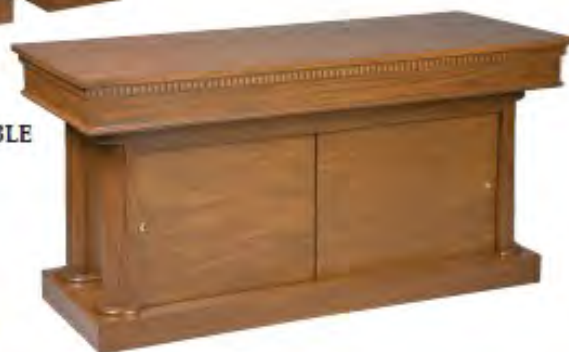
NO. 8300 COMMUNION TABLE 60" W, 24" D, 32" H