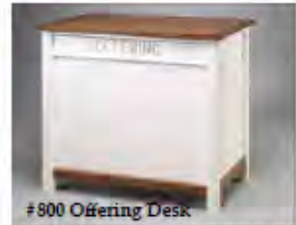
#800 Offering Desk 36" Long x 22" Deep x 32" High

Offering Tables and Offering Desks are finely hand-crafted and are available with optional locking drawer, or inscriptions "TITHE" or "OFFERING".