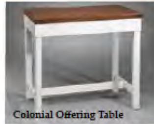
Colonial Offering Table 36" Long x 22" Deep x 32" High