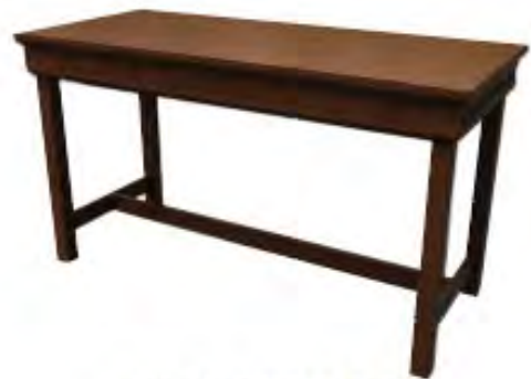
NO. 905 OPEN TABLE 54" W, 22" D, 32" H