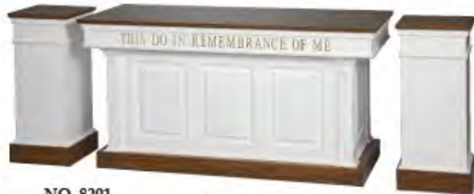
NO. 8201 FLOWER STAND 14" x 14" x 32"H