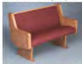
NO. 953 / 984 SEDILIA Upholstered foam cushioned back and seat.

Available in a variety of finishes and fabrics, and in one-seat (2'4") and two-seat (4'0") sizes.