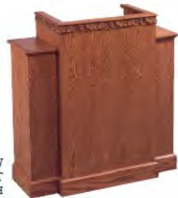
NO. 500W WING PULPIT 45" W, 18" D, 48" H