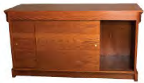
NO. 900 COMMUNION TABLE Sliding by-pass doors