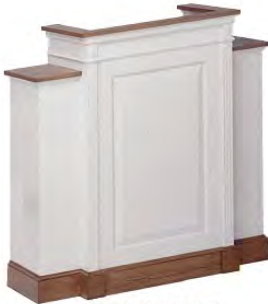
NO. 820W WING PULPIT 45" W, 18" D, 48" H