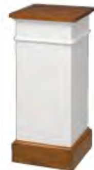
NO. 810 FLOWER STAND 14" x 14" x 32" H