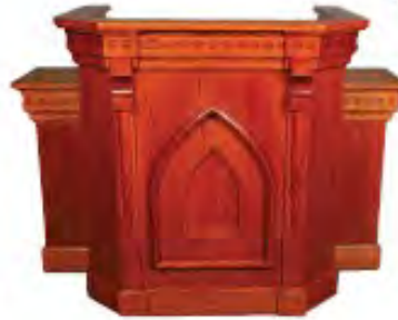
NO. 900W-2 WING PULPIT 68" W, 34" D, 48" H