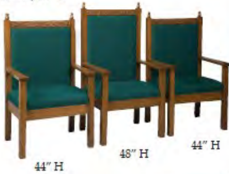
NO. 500 Pulpit Chair 27" W, 21" D