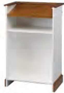
NO. 811 PULPIT 29" W, 18" D, 48" H