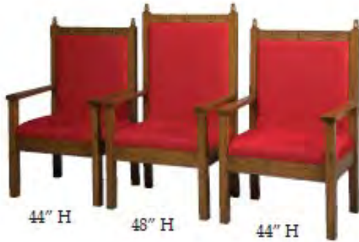
NO. 200 PULPIT CHAIR 27" W, 21" D