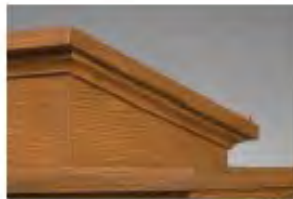
NO. 8301 PULPIT 36" W, 24" D, 46" H 16" x 20" Bible Rest