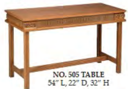
NO. 505 TABLE 54" L, 22" D, 32" H