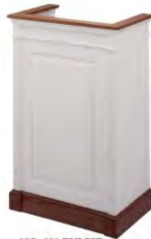
NO. 821 PULPIT 29" W, 18" D, 48" H