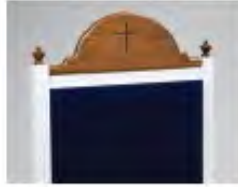
OPTIONAL CROWN BACK