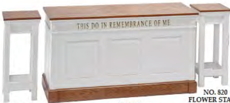
NO. 820 FLOWER STAND 14" x 14" x 32" H