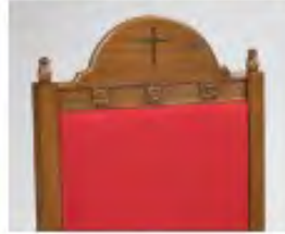
OPTIONAL CROWN BACK