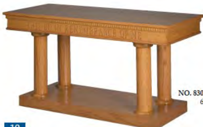
NO. 8305 COMMUNION TABLE 60" W, 24" D, 32" H