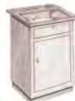
NO. 32 MEMORIAL DESK 24" wide, 18" deep, 42" high