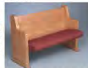
NO. 940 / 984 SEDILIA Upholstered foam cushioned seat, flat wood back.

940 / 984 - (1) One Seat 2' 4" 940 / 984 - (2) Two Seats 4' 0"