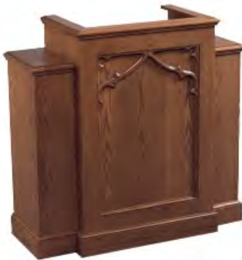
NO. 200W WING PULPIT 45" W, 18" D, 48" H