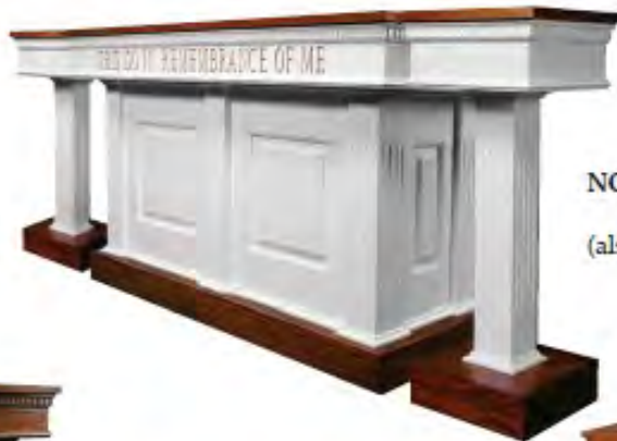
NO. 8400 FLOWER STAND 14" W, 14" D, 32" H (also available in all-stained)