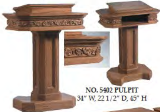
NO. 5402 PULPIT 34" W, 22 1/2" D, 45" H