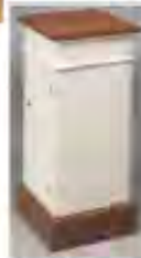
#80 Tithe Box 14" x 14" x 32"