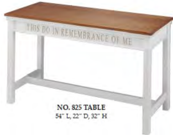
NO. 825 TABLE 54" L, 22" D, 32" H