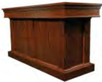
NO. 8420 COMMUNION TABLE 60" W, 24" D, 32" H (two-toned above, all-stained right and left)