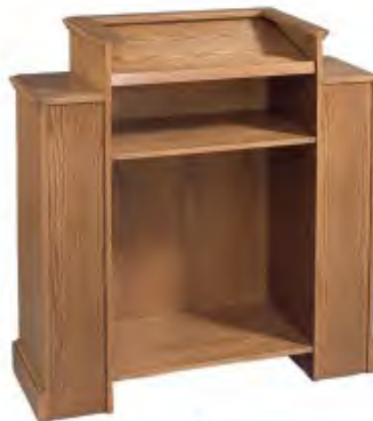
NO. 200W WING PULPIT Rear view