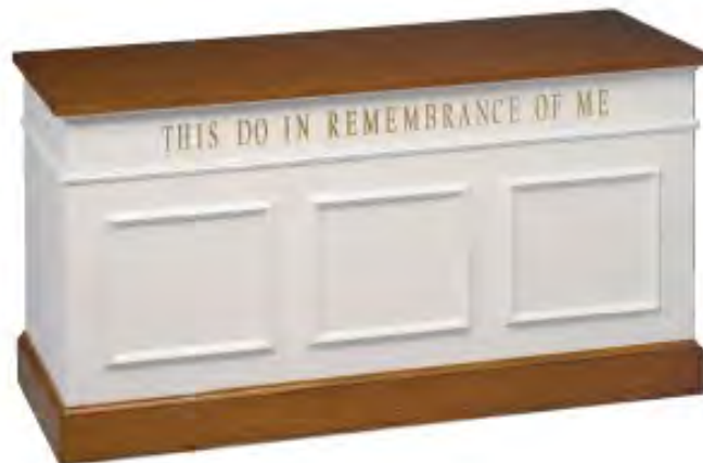
NO. 810 COMMUNION TABLE 60" W x 24" D x 32" H