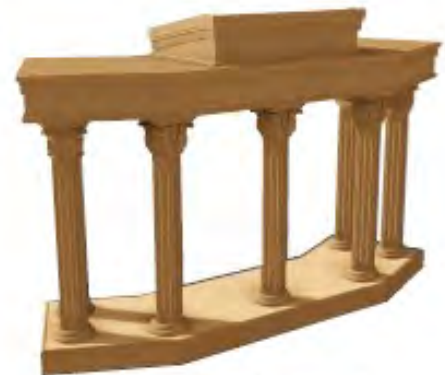
NO. 8501W WING PULPIT 76" W, 27" D, 48" H