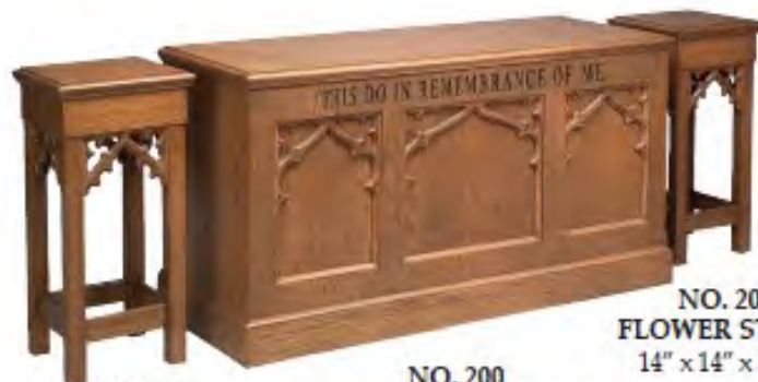
NO. 200 FLOWER STAND 14" x 14" x 32" H