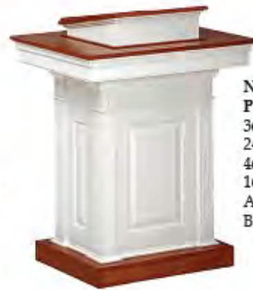
NO. 8201 PULPIT 36"W, 24" D, 46" H 16" X 20" Adjustable Bible Rest