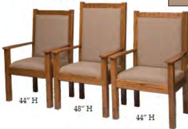
NO. 900 PULPIT CHAIR 27" W, 21" D