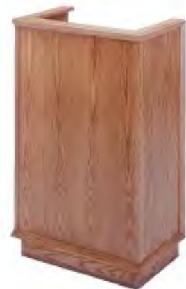
NO. 401 PULPIT 29" W, 18" D, 48" H