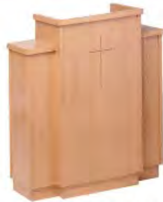
NO. 300W WING PULPIT 40" W, 16" D, 48" H