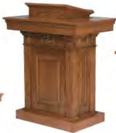
NO. 8201 ALL-STAINED PULPIT Adjustable Bible Rest telescopes up and down.