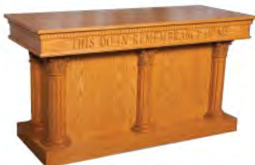
NO. 8500 COMMUNION TABLE 60" W, 24" D, 32" H