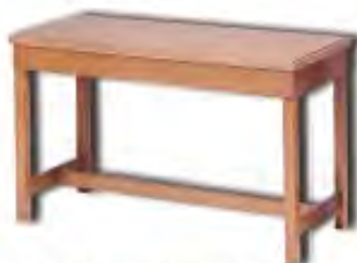
NO. 305 FOYER TABLE 54" long, 22" deep and 32" high.

NO. 300 SERIES - Wood seat NO. 400 SERIES - Fixed padded seat (as shown) NO. 500 SERIES - With loose cushion