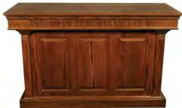
NO. 8201 COMMUNION TABLE, ALL-STAINED 60"W x 24"D x 32" H