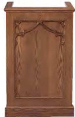
NO. 201 PULPIT 29" W, 18" D, 48" H