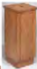
#40 Tithe Box 14" x 14" x 32"