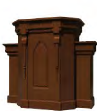
NO. 900W-1 WING PULPIT 56" W, 24" D, 48" H