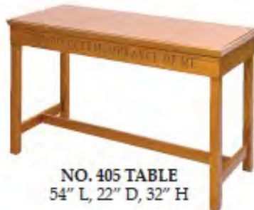
NO. 405 TABLE 54" L, 22" D, 32" H