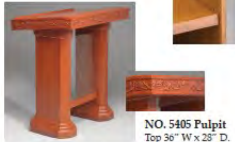
NO. 5405 Pulpit Top 36" W x 28" D. Overall height 43"